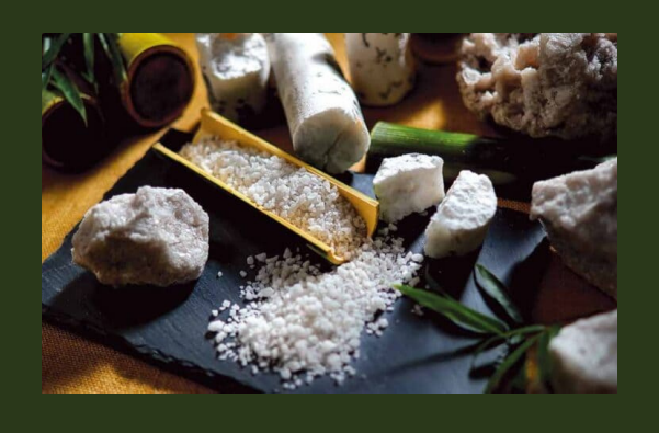
Why Choose Zoltana Bamboo Salt?

E/496, Chitrakoot nagar, Bhuwana, Udaipur, 313001